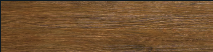
LV4134 Caramel WE