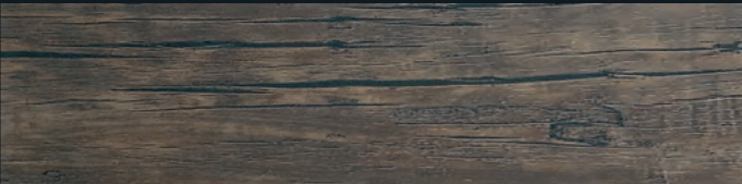
LV3327 Eclipse WE