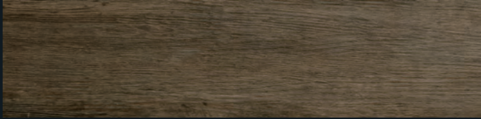
LV8235 Blackjack WE