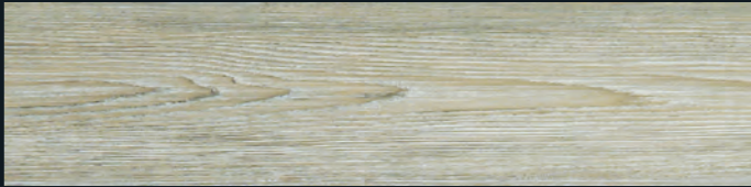
LV8273 Milky Way WE