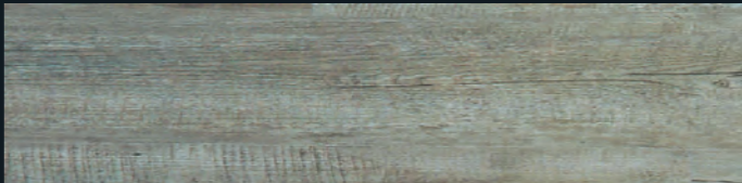
LV8245 Titanium WE