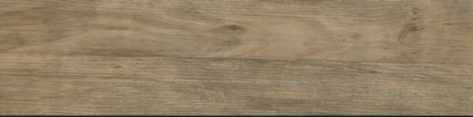
LV4130 Riverwood WE