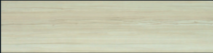
LV7247 Truffle WG