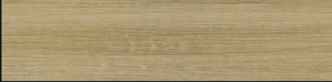
LV8283 Summit WE

WG - Wood Grain Surface WE - Wood Embossed Surface HS - Handscraped Surface