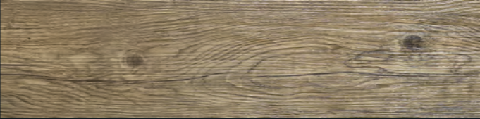
LV4126 Venus WE